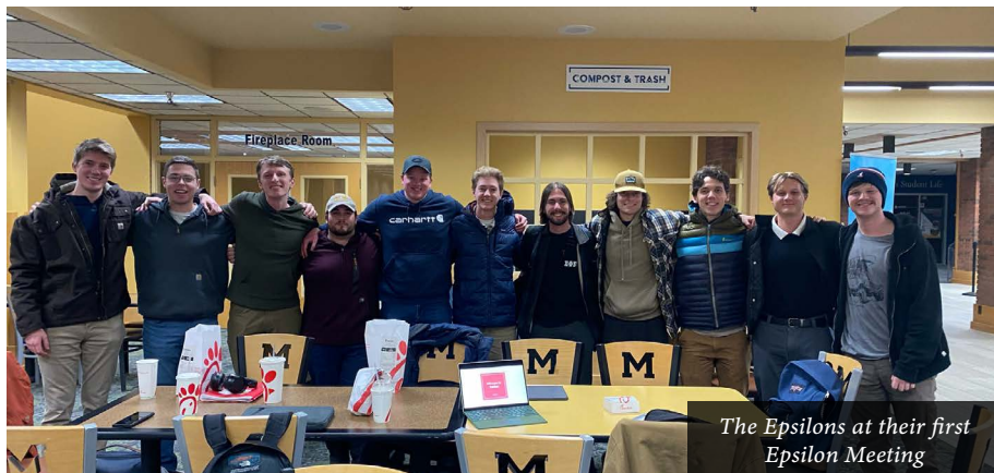
The Epsilons at their first Epsilon Meeting

With Eudaimonia being a lifelong pursuit of happiness, the momentum that the Epsilons have begun will not stop here – keep an eye out for these brothers, the world is in their hands!